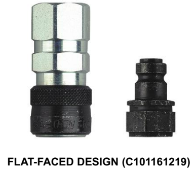
FLAT-FACED DESIGN (C101161219)